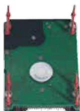
Mounting in compression