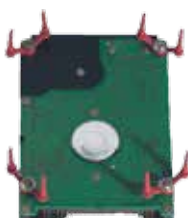
Mounting in shear